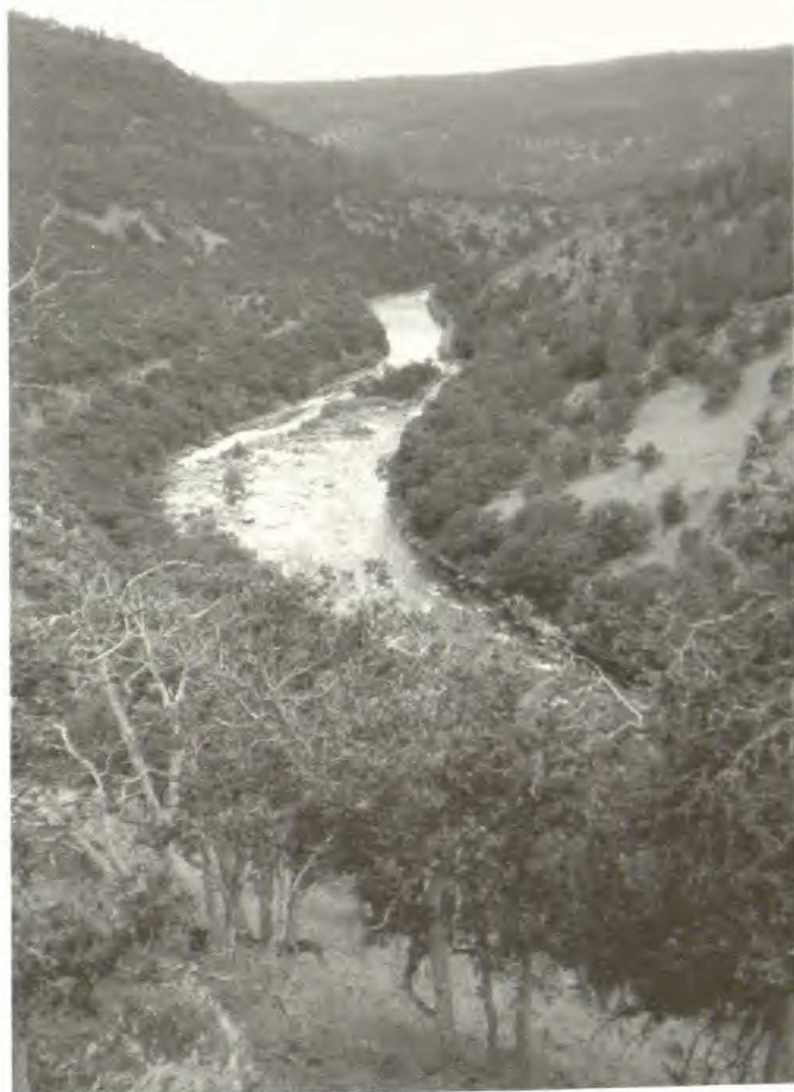
FIGURE 2. — Upper Klamath River Canyon with Oregon white oaks in foreground.

Climate. — The climate of the Upper Klamath River country is transitional between a continental climate and one strongly modified by the presence of the Pacific Ocean. Since the Upper Klamath River falls within the rain shadow of the Klamath Range to the west, the incoming Pacific storms are usually diminished and precipitation is comparatively low, particularly for a Cascade Range location, averaging between 31.2 - 48.5 cm (12.3 -16.1 in). 2 The most important characteristic of the climate is its unpredictability. A wet year may be followed by a year so dry that it would fit the pattern of the Great Basin. Unusually warm weather in late spring, summer, or early fall may be followed by a hard freeze. The average year in this locale is a summation of mean climatic values around which the actual weather and year-to-year climate oscillates wildly (Figure 3). This intrinsic climatic variability profoundly affects the year-to-year availability of many of the plant food resources found within the study area.